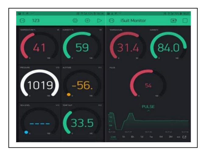
Fig. Mobile Application Screen

money for the individual as well as the company. As according to our innovative prototype this cost around 1200 INR in total and the market price of a completely factory-made product will be even lower below 1000 INR. This negligible investment will yield a long term benefit. This can improve the employment opportunity of the fields where people fear to work due to high temperature. As iSuit is completely Wi-Fi controlled, there are very less instances of signal failure which won't affect the functioning of devices as it performs autonomously without connectivity too.